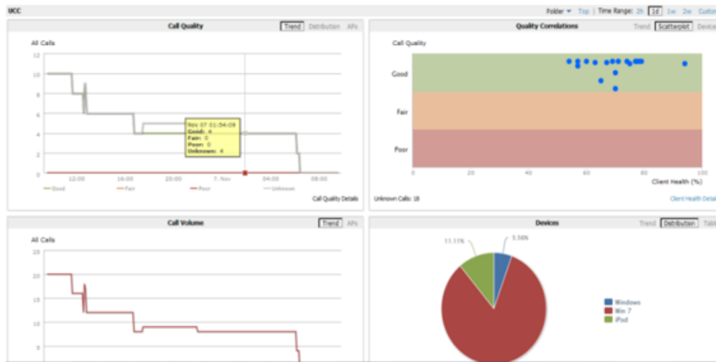
Figure 3: UCC Dashboard Example